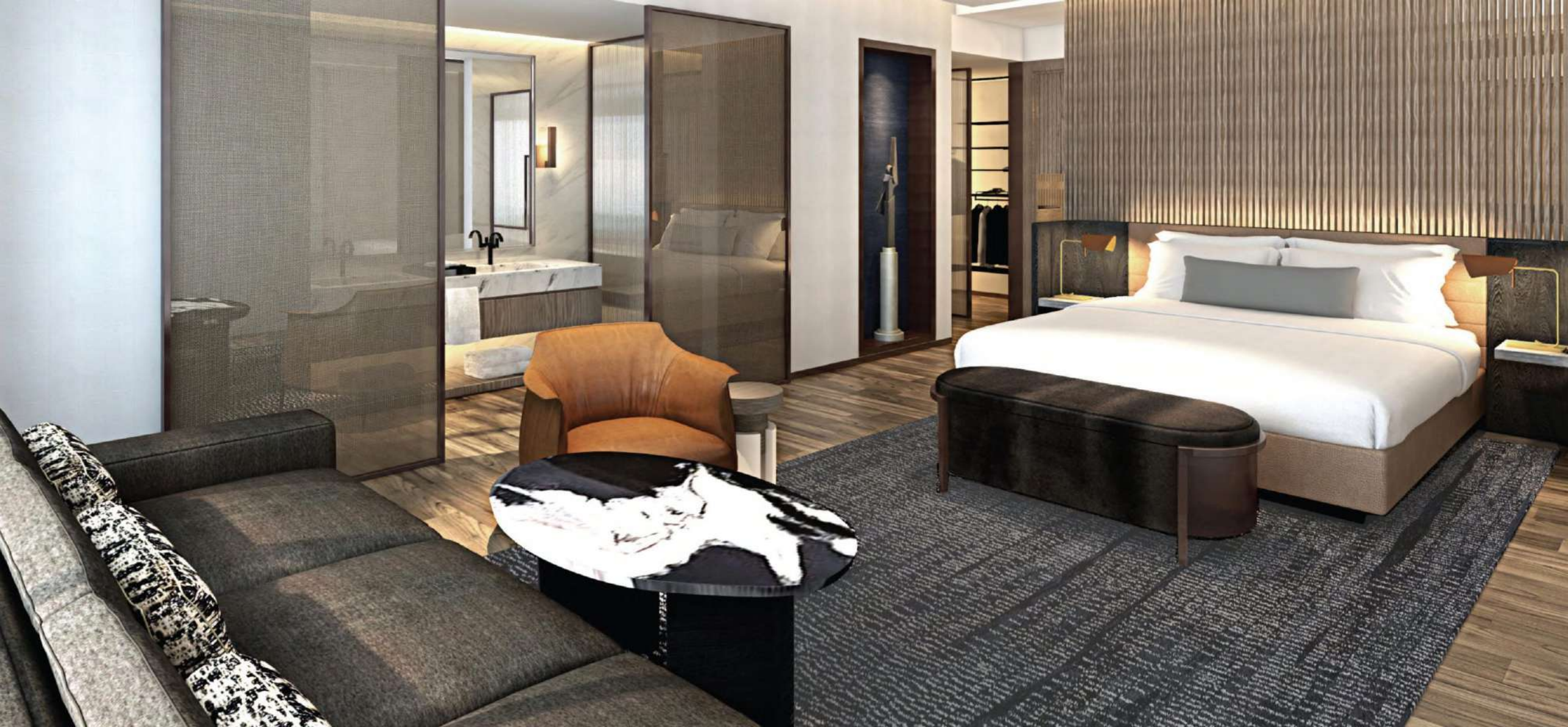
Aruga Hotel in 2019